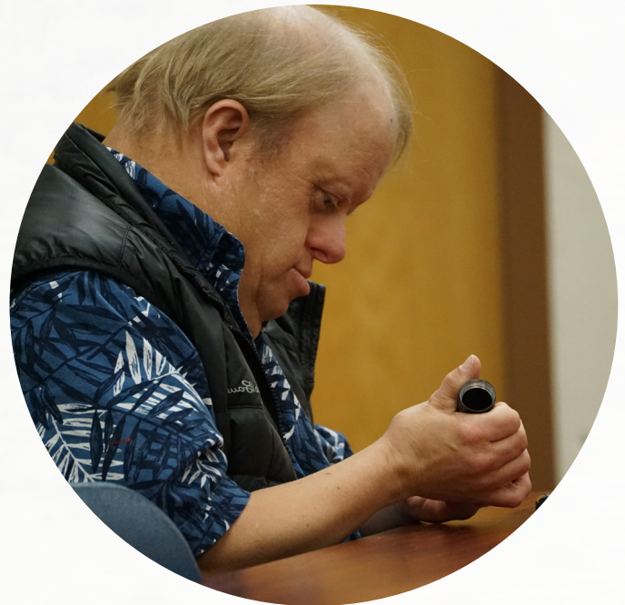
ELECTRICAL CIRCUITS CLASS