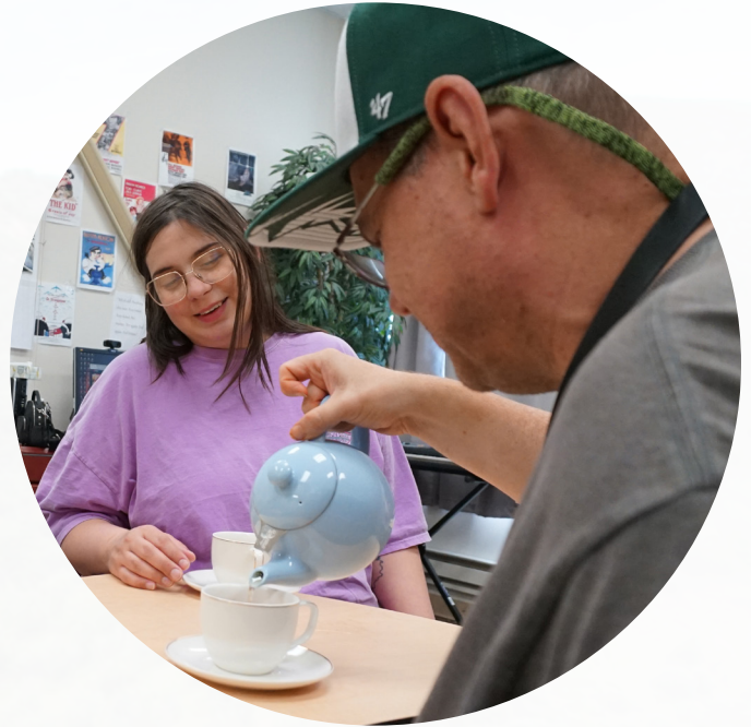
TEA CEREMONY CLASS